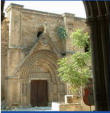
Gothic portico on northern facade before restoration, Selimiye quarter - 2003.