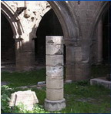
Stone pillar ruins, Selimiye quarter - 2003.