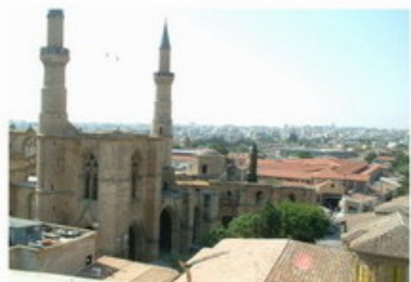
Overall view of the Bedestan & Selimiye Mosque.