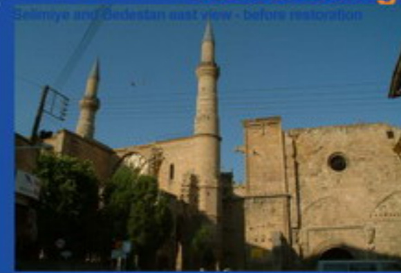
Selimiye and Bedestan east view - before restoration