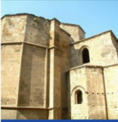
Apse before restoration, Selimiye quarter - 2003.